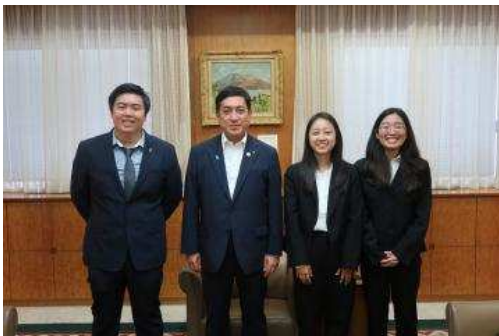
•With the Prefectural Scholarship Exchange Students

According to the governor, he hoped the students would work hard in their studies, enjoy Kagoshima's delicious foods and alcohol, and share the merits of Kagoshima after returning to their home countries.