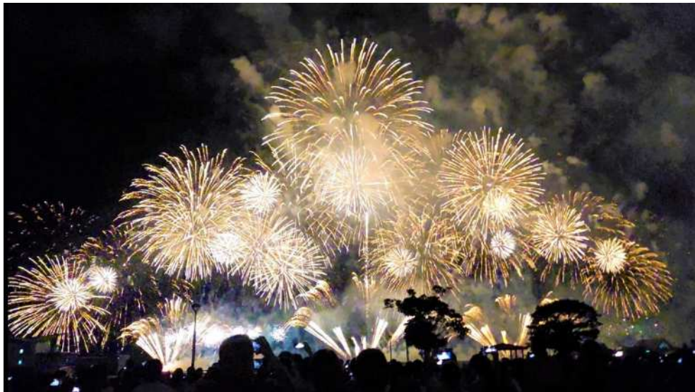
• The fireworks finale