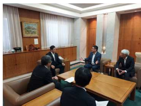
•During the courtesy visit