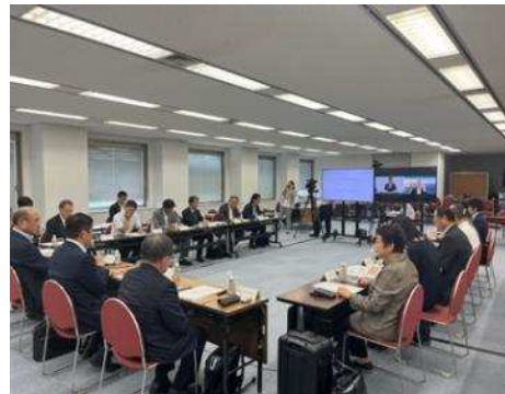
•During the meeting