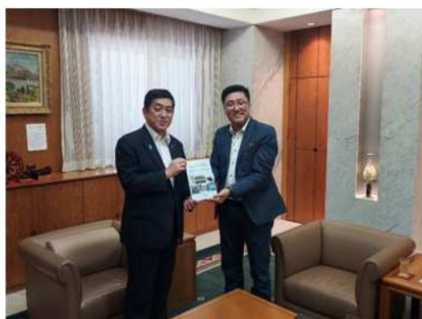
•The Chairman of Brazil Kagoshima Kenjinkai

We would like to continue to build on the exchanges that we have and further develop our relationship of exchange and cooperation with the Kagoshima Kenjinkai Brazil.