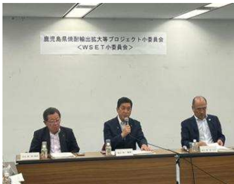
•Speaking at the meeting

Kagoshima Prefecture will work closely with the national government, the Prefectural Sake Brewers' Association and other related parties in order to strategically expand exports of Kagoshima's world-reowned honkaku shochu.