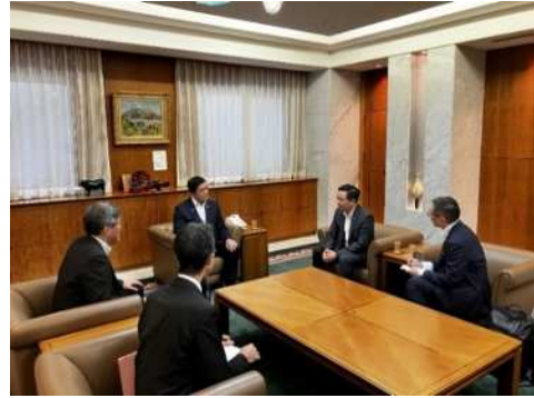
•During the opinion exchange