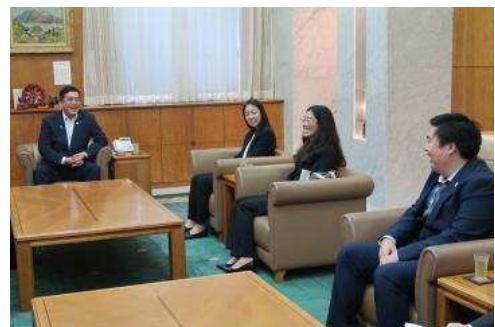
•During the visit