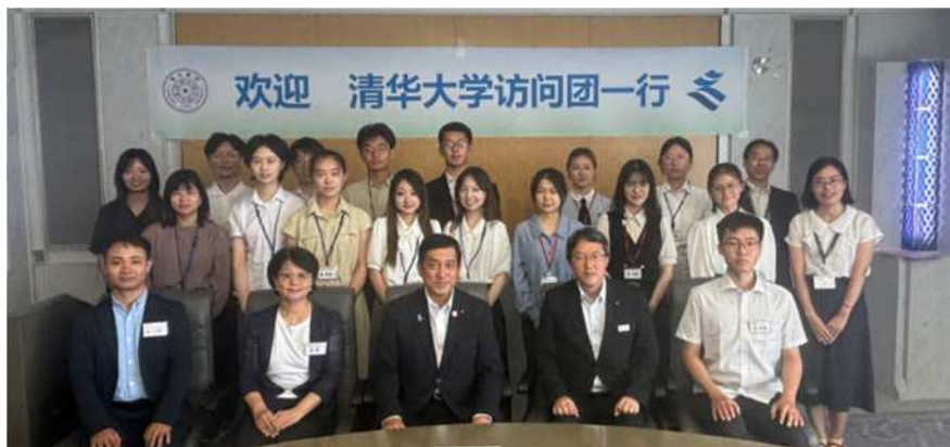
•With students from Tsinghua University