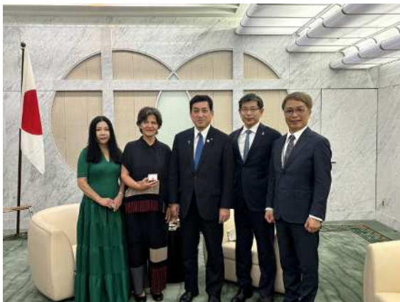
• Commemorative photo with the Ambassador of the Hashemite Kingdom of Jordan