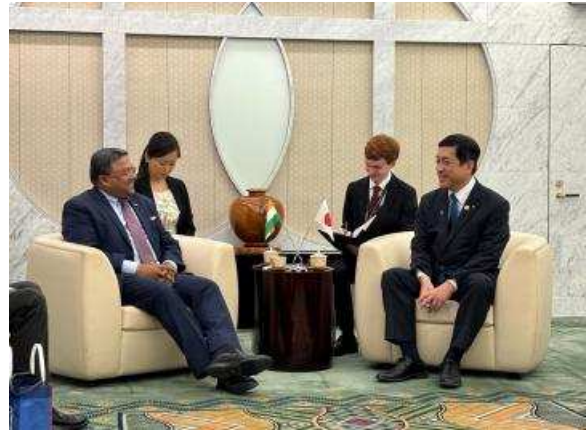
• During the courtesy visit