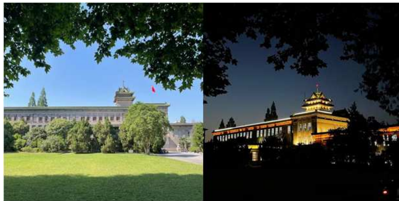
The school building at Nanjing Agricultural University in China, where I work.

I will continue to learn and do my best. Thank you in advance you're your support!