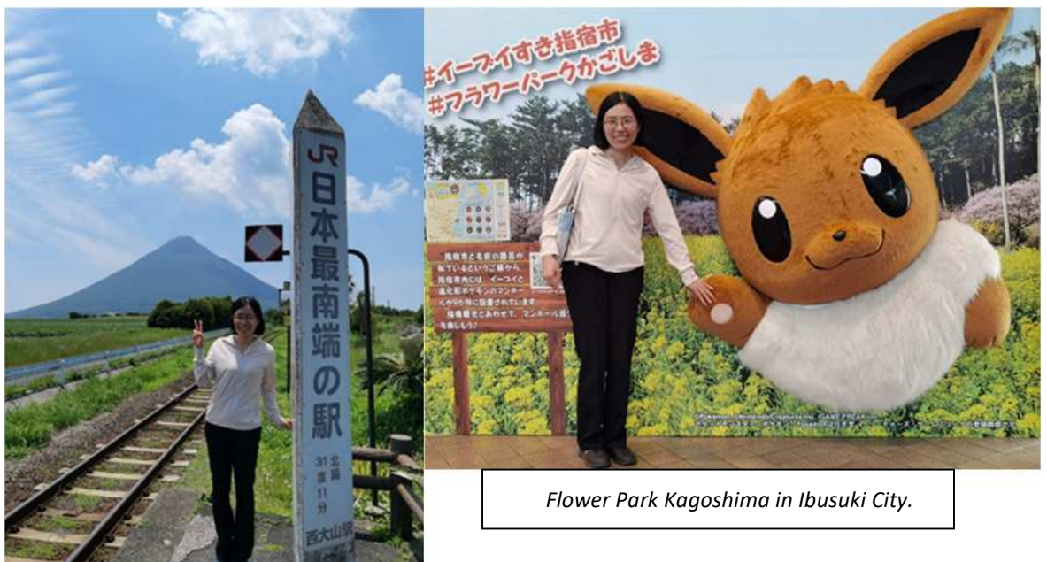
Flower Park Kagoshima in Ibusuki City.