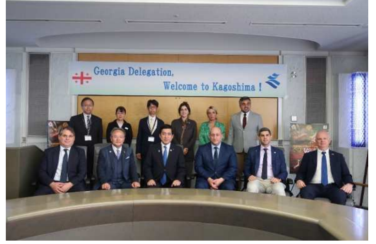
Commemorative photo with the Georgia Delegation