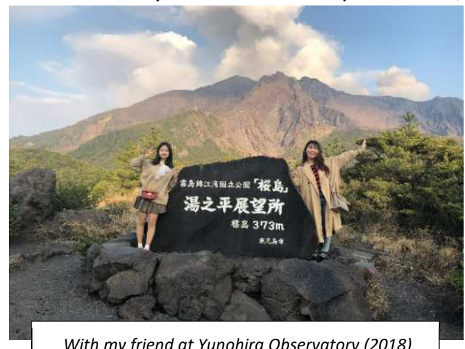
With my friend at Yunohira Observatory (2018)

Kagoshima ramen, shirokuma shaved ice (the list goes on...), and made many fun memories. I remember telling my friend "I love Kagoshima!" on the way back to Korea. So, I'm really happy to be able to come back to Kagoshima, and during my time living here, I hope to make even better memories than when I visited in 2018.