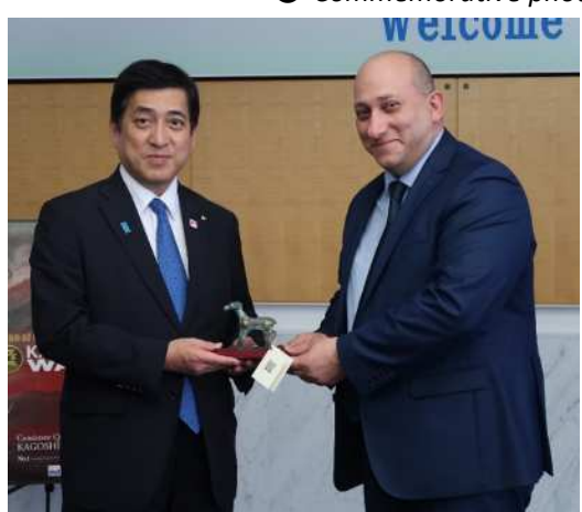
● A gift presented by Deputy Minister of Foreign Affairs, Alexander KHVTISIASHVILI