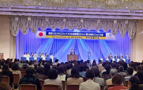
At the conference venue