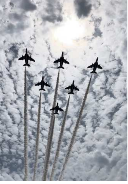
The spectacular display from Blue Impulse with 6 planes flying in formation!