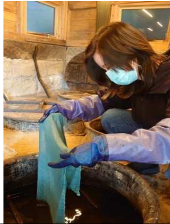
Dipping the fabric into the dye

It is then that we could see the final fruits of our labour, and the beautiful blues are revealed!