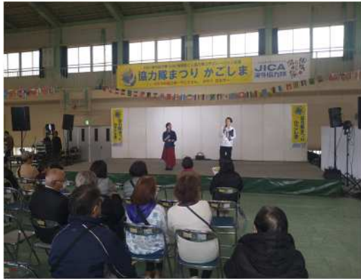
▲ The Stage Event