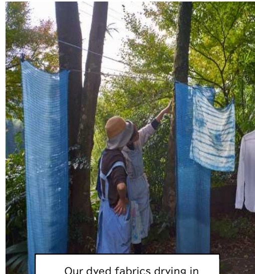
Our dyed fabrics drying in the natural sunlight

If you're looking to get an authentic taste of traditional Japanese craftsmanship and an afternoon of wonderfully-enriching experiences, look no further than Aizomeya and its all-natural indigo dyeing experience!