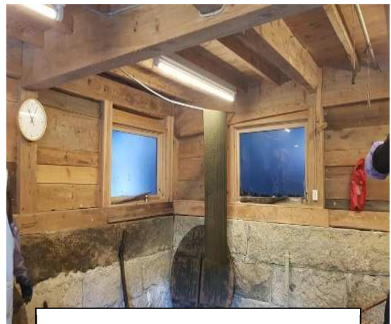
A deep green colour while air-drying in between dips