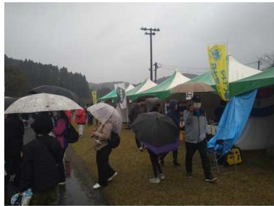
▲ Booths run by Local Revitalization Cooperation Volunteers