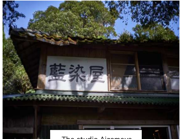
The studio Aizomeya

But thanks to the dedicated craftsmen who have inherited and passed down the traditions and techniques throughout the years, this traditional craft has been kept alive and going strong even today.