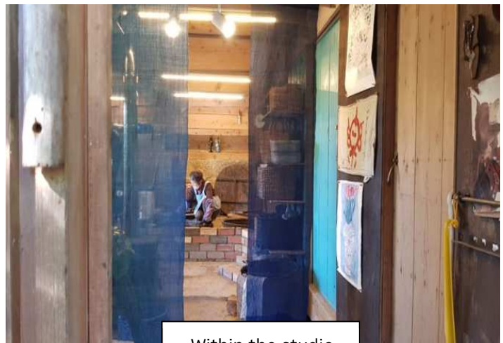
Within the studio