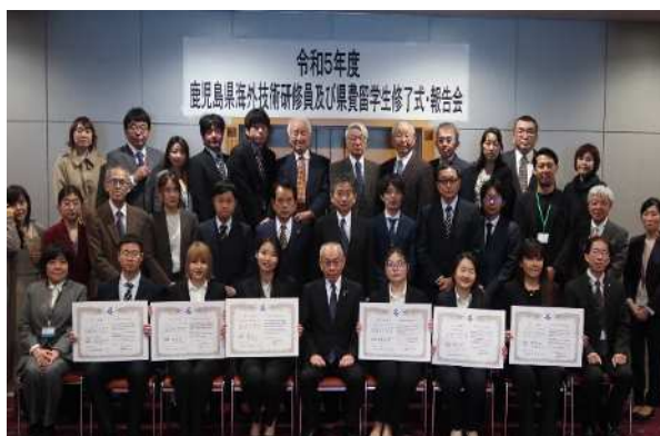
◀ The participants with the people that supported them

As they return home, we look forward to seeing the participants use the skills, knowledge and experience they gained here to contribute to the development of their home countries, all while they continue to forge stronger bonds between their countries and Kagoshima!