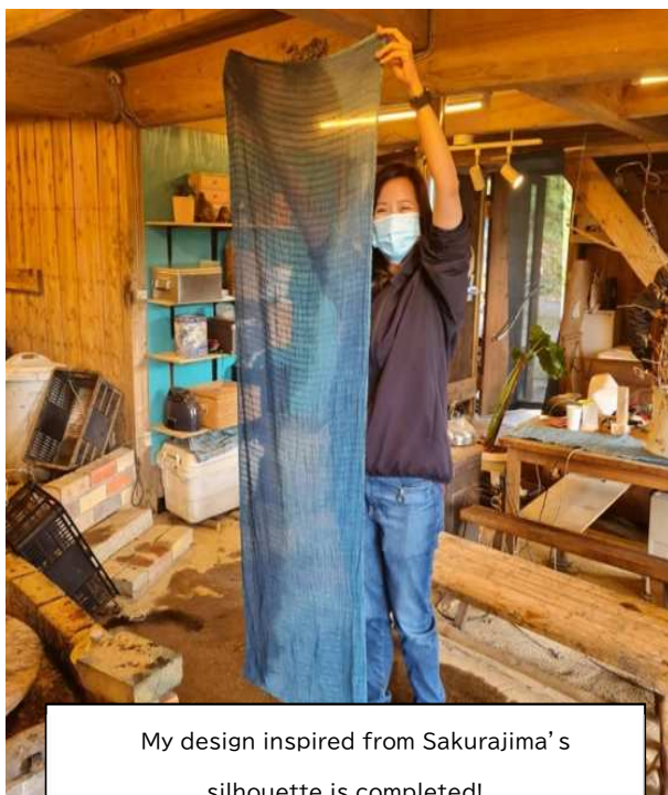
My design inspired from Sakurajima's silhouette is completed!