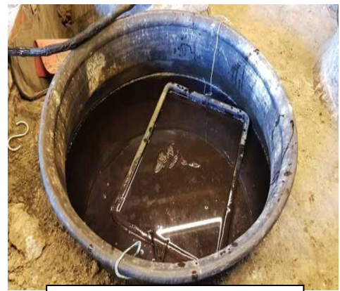
Soaking the fabric in dye