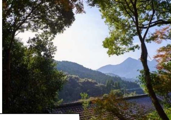
The studio surrounded by lush nature

Surrounded by lush mountains, natural scenery and fresh air, the studio Aizomeya offers an engaging indigo dyeing experience, as well as an adjoining store selling clothing and accessories dyed in the striking indigo blue.