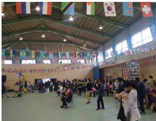
▲ Visitors Gathered in the Gym