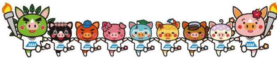
Mascot Characters of Kagoshima Prefecture: Guribu Family

The 75 th National Sports Festival Kagoshima was held from 7 Oct to 17 Oct 2023, and following that, the 20 th National Sports Festival for the Disabled was held from 28 Oct to 30 Oct 2023.