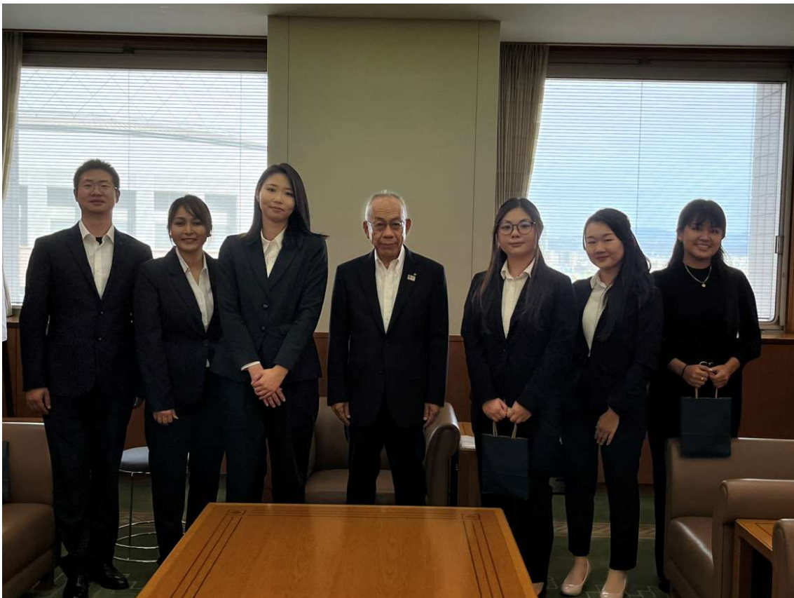
During the Courtesy Visit

We look forward to the continued success of both the trainees and exchange students in the future.