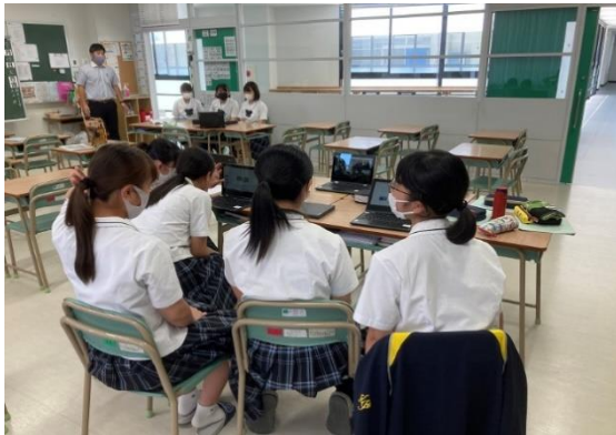
7/14 Active English Program in Kanoya Girls' High School