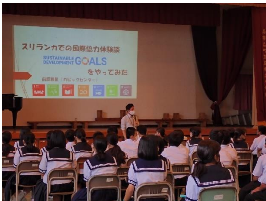
6/22 On-site lessons at Shibushi Junior High School