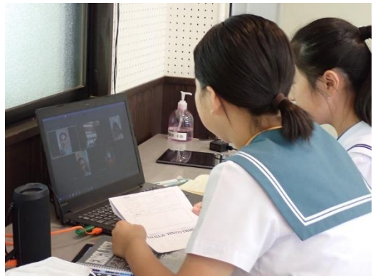
7/28 Kirishima Global Activity

KAPIC Center has been conducting on-site lessons at Kanoya Girls' High School since last year, and also held online exchanges with Prince Royal's College in Thailand this year. In addition, KAPIC Center also hosted a part of the Kirishima Global Activity this year, which was organized by Kirishima City Education Committee. In this event, online exchanges were held between junior high school students from Kirishima City and students from Russia, Thailand and Azerbaijan.