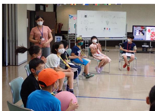
7/11 The Second English Challenge

Since 2020, foreign language activities has been compulsory for elementary school students who are of third grade and above, and learning English has been becoming increasingly important. In this context, KAPIC Center is holding English events for elementary school students together with Assistant Language Teachers (ALTs) in the Osumi Peninsula. We believe that we can contribute to the development of cosmopolitan human talents by having fun with using English from the early stages of life in elementary school and having an enjoyable time interacting with foreign teachers.