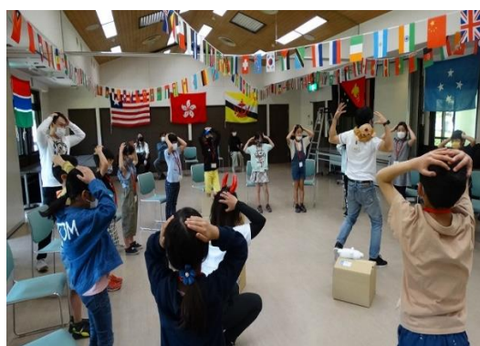
4/25 The First English Challenge