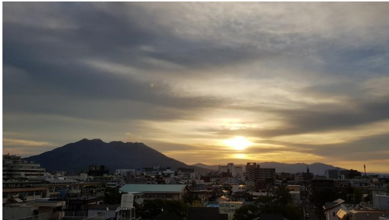
Sunrise over Sakurajima

I have only been here for 3 weeks, but during the bustle of settling down I was able to experience the warm hospitality of the people here and I am really grateful for it. Being a naturally shy person who is insecure in my Japanese, this is a big step out of my comfort zone. However, I am learning and adapting fast thanks to the kind patience of everyone around, while enjoying each step of the process along the way.