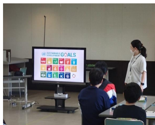
10/19 Educational visit at Harada Elementary School

KAPIC Center offers various programs about global understanding, but recently there has been an increase of requests from schools for programs and on-site lessons that include content about Sustainable Development Goals (SDGs). Hence, we are also currently promoting the enhancement of various SDGs-related programs. This is done by incorporating the essence of SDGs into existing global understanding programs or designing programs solely focusing on SDGs.