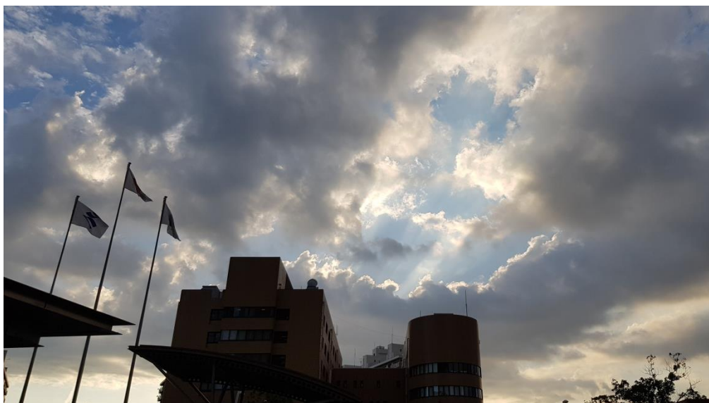
Sunset sky near the Prefectural Office

I have barely been here for less than a month and the future stretches out ahead, bright and full of potential. As a newcomer, there are many things which I am still learning but I will do my very best. Again, I really appreciate all the gracious support of everyone around and I look forward to your kind guidance!