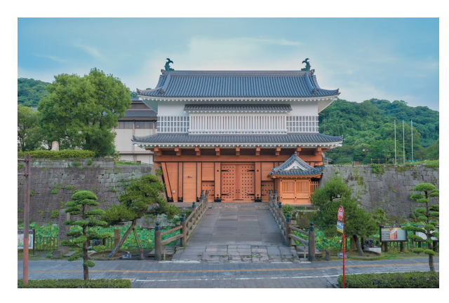
▲The Goromon Gate