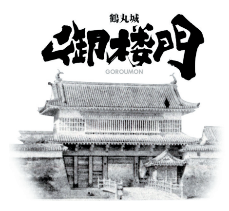
▲Logo of the Goromon Gate

Tsurumaru Castle Goromon Gate Construction Council Tsurumaru Castle Goromon Gate Reconstruction Executive Committee