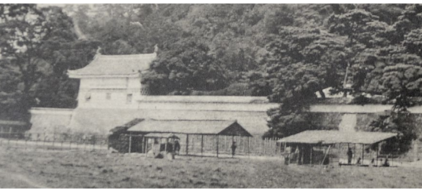
Osumi Yagura, photographed in 1872