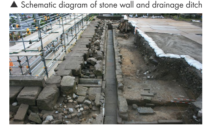
Excavated ruins of a drainage ditch