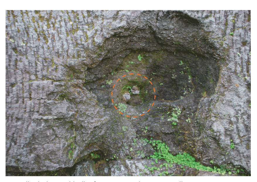
▲ Bullet holes and bullet fragments in the stone wall

Stone walls (approx. 100 m north from here: see the map on the bottom right) of the private school and its surrounding area built in the ruins of Kagoshima (Tsurumaru) Castle's stable (currently Kagoshima Medical Center) are valuable assets that tell the story of the Satsuma Rebellion, the last civil war in Japan.