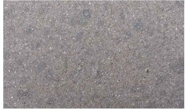
▲The horizontal section of welded tuff

The black layer in the vertical section is obsidian created by the changing heat and pressure of pyroclastic-flow deposits. Pressure from above formed the thin layer.