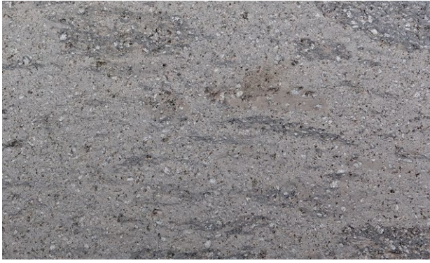
▲The vertical section of welded tuff

The black layer in the vertical section is obsidian created by the changing heat and pressure of pyroclastic-flow deposits. Pressure from above formed the thin layer.